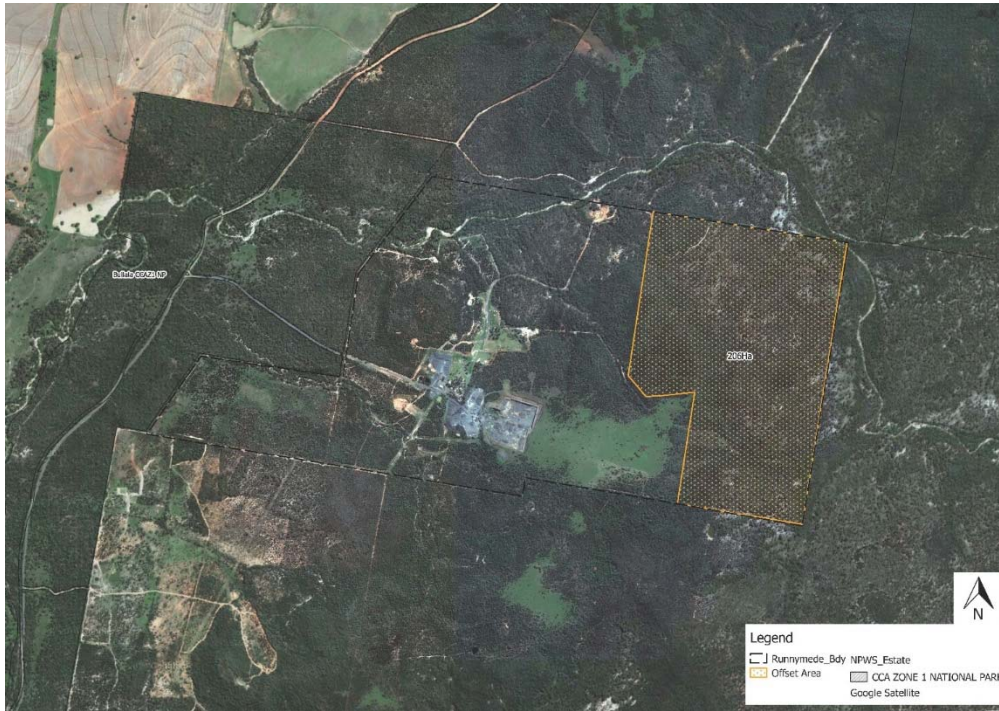
Figure 1: Offset Map